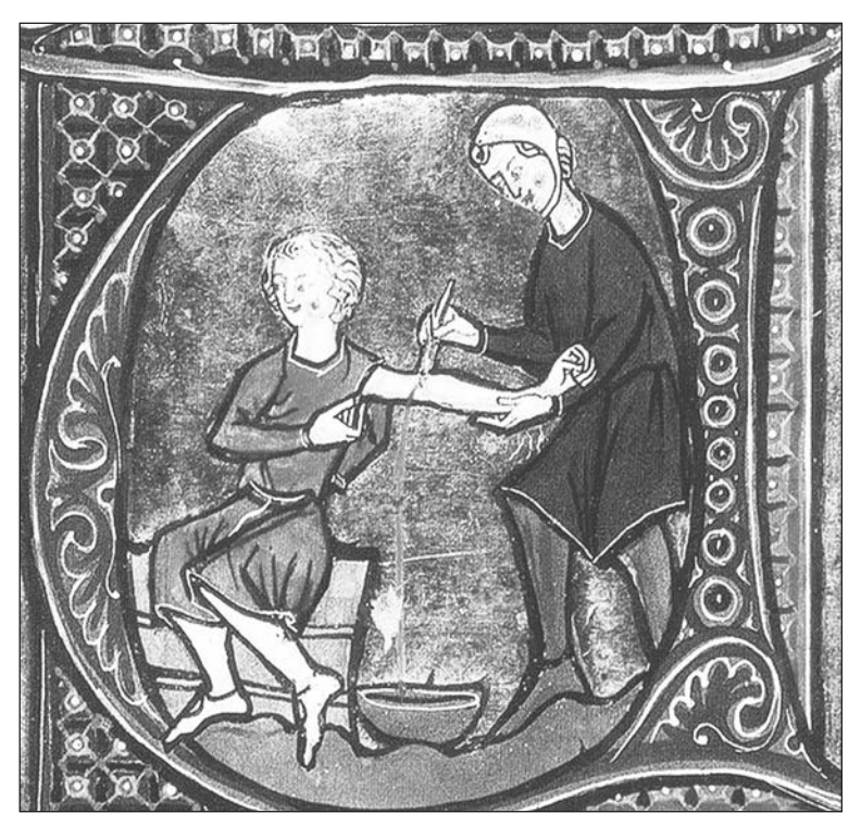
[A medieval doctor bleeding a patient]